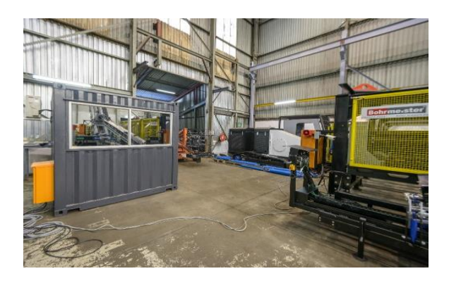
Air Conditioned Operator Container