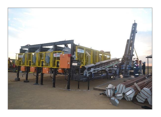
"Hands Free" Rod Handler & Roto Magazine