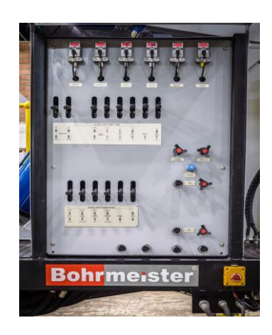
Local Drilling Panel