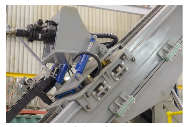
Tilting & Slide Out Head