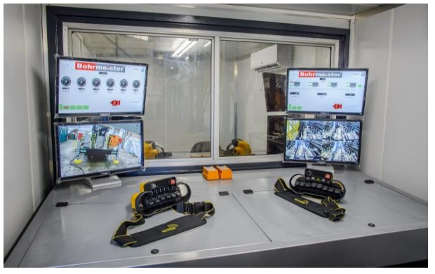
Remote Wireless Pendant Control