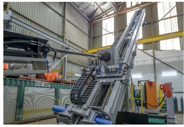
Directional Drill Rig in the Factory